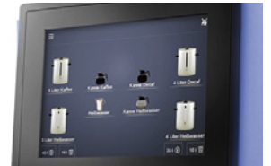
A 10" touch screen with animations gives new levels of easy user control