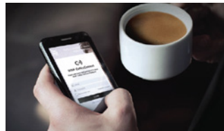
WMF CoffeeConnect is built in and allows you to monitor your 9000F