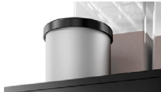
Automated cleaning process with almost no manual intervention