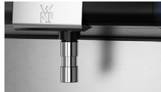
Hot water and coffee dispense from front of machine for Jug service