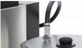
Brew directly into 20L urns on trolleys for large scale coffee service