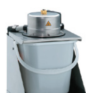
Waste system strains out coffee from drainage for ease of disposal