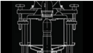
Patented brewer design doesn't require paper filter or manual handling

The new WMF 9000 F automatic filter coffee machine ensures first-class moments of pleasure for the mass catering sector. Despite its slim dimensions, the powerhouse impresses with an output of up to 100 litres per hour, and the boiler also guarantees that coffee lovers never have to wait long for their beverages.